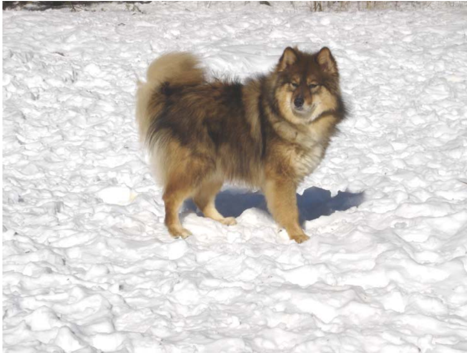
Eurasier : Luna Nueva Shaggy v Eurasia

I charge a fair price for well socialized puppies, raised in home environment, in a holistic way and sold with a lifetime guarantee. I find it kind of unfair when people expect healthy puppies, health guarantees, great socialization, help & support in case of problem and when comes their turn, they are not willing to contribute to our Eurasia breeding program by cooperating with the health tests.