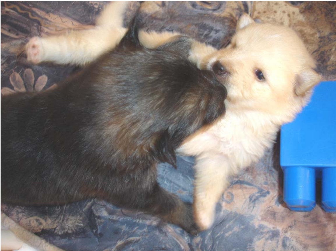
Three week old Finnish Lapphund puppies .

All photos copyrighted Eurasia reg'd 2007. This file can not be used (in part or in total) without the written consent of its author.