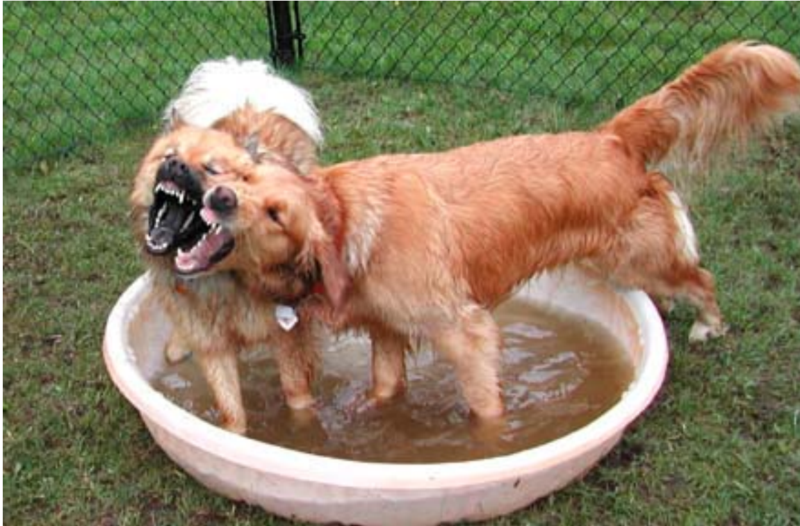
Eurasier : Cassandra of Eurasia & her friend Golden Retriever

The leader is the one who should always control plays and win them. When the leader decides to stop the play... the dog needs to respect it!