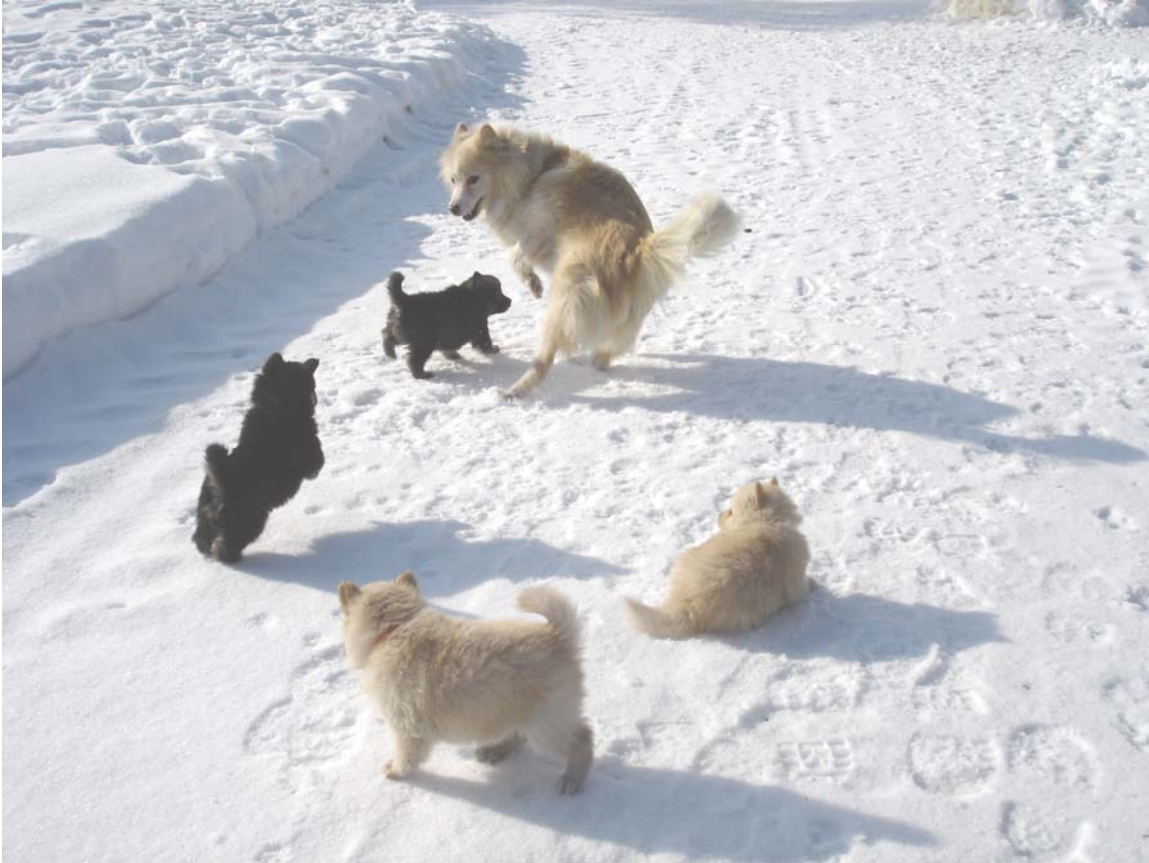
Finnish Lapphund : Sugarok Ayla Fleur of Eurasia & her litter

The Eurasier is no exception. Like its wolf ancestor, the Eurasier needs to live in a pack. But what exactly is a pack? The Eurasier we know today is not a wolf. Eurasiers were developed to be our beloved companion and to share our life. With many generations, all dogs lost many of their wolf's attitudes and developed a specific dog's communication. The dog's communication is a bit different from the wolf's one.