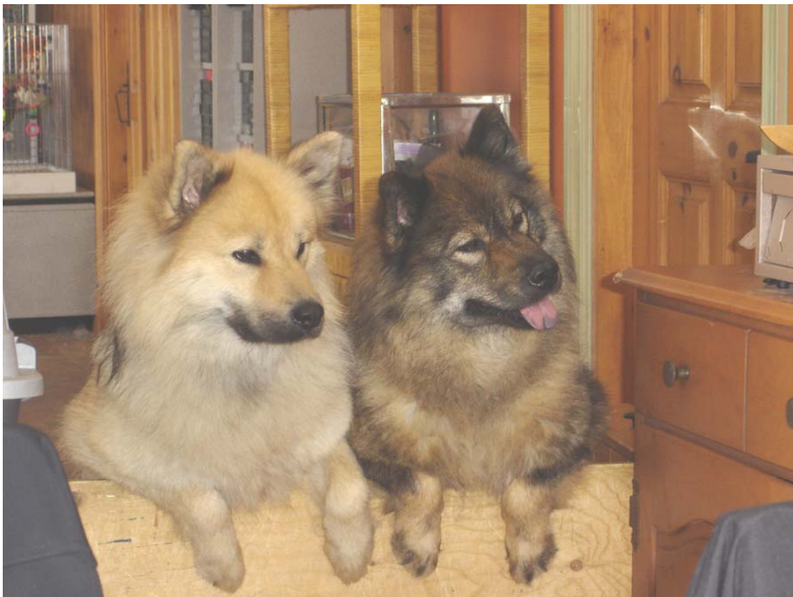
Eurasiers : Dancing Bear Ally to Eurasia & Fatal Attraction of Eurasia

Behaviorist Cesar Millan explains the leadership as energy and I like his point of view. Energy is every where... positive and negative. When your own energy is positive, your dog will answer positively because your body language will be in accordance to it. But when your own energy begins to be negative (fear, frustration, anger, sadness) your dog feels it and will interpret it as stressfull energy. Some will react with shyness, others with aggressiveness. This is the way energy comes and goes.