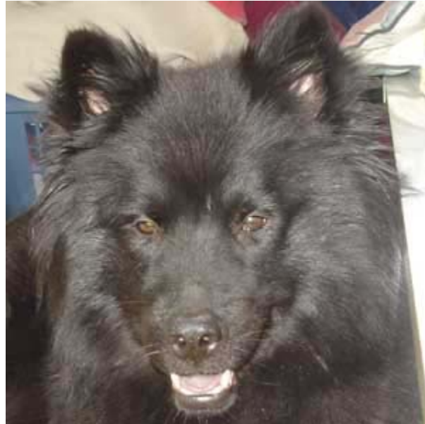
Eurasier : Vanille de NiouTchouang