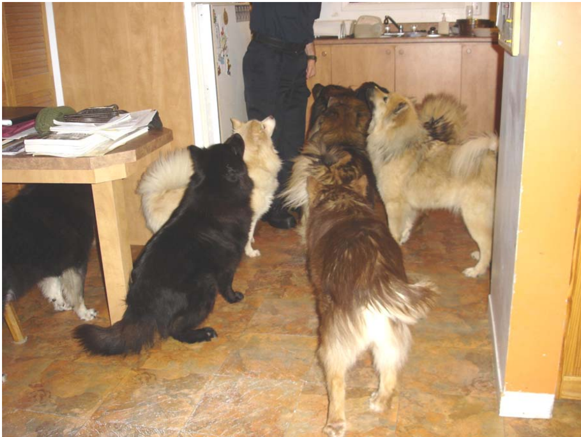
The Eurasia pack in our kitchen... photo 2006

To obtain success in dog's education, all owners need to become their Eurasier's best friend and mother. A calm and trustful leader makes the best friend and the best mother. A leader gives rules, boundaries and limitations. Lack of leadership opens the door to all kind of behavioural problems.