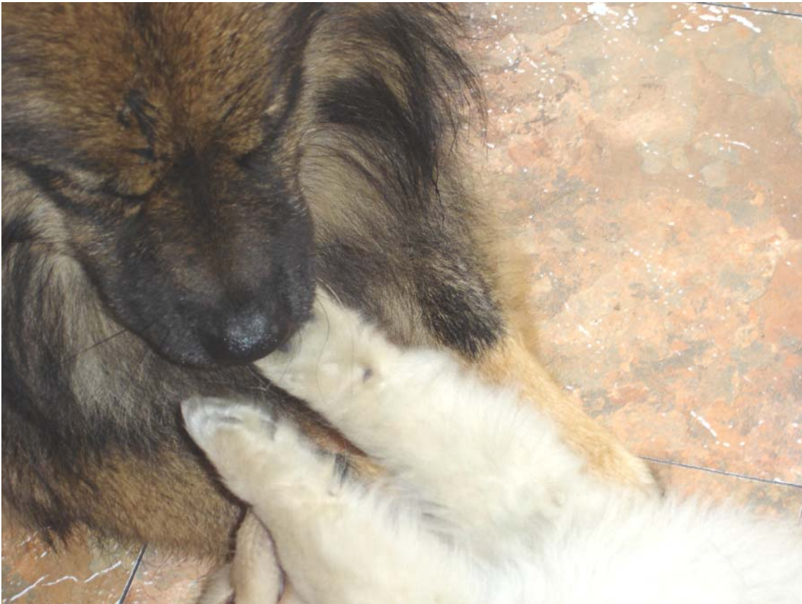
This Lapphund puppy has a submissive attitude in front of our beloved Eurasier Black Motion Simba of Eurasia . This is a part of dog's body language we should understand and use in every dog's education program.

Your dog was trained in obedience and it executes all commands you ask it to do. Fine... but this has no connection to the leadership attitude! Obedience training is like your job. You do it from 9h00 to 17h00 and after work, you do your best to forget it and relax! It's the same thing for your dog. Under leash, in a dog training school, the dog does its job. But when it returns to home, if the leadership is not there, the dog "forget" its obedience and can even challenge the owners! The leadership is based on your body language and attitude, not on your words.