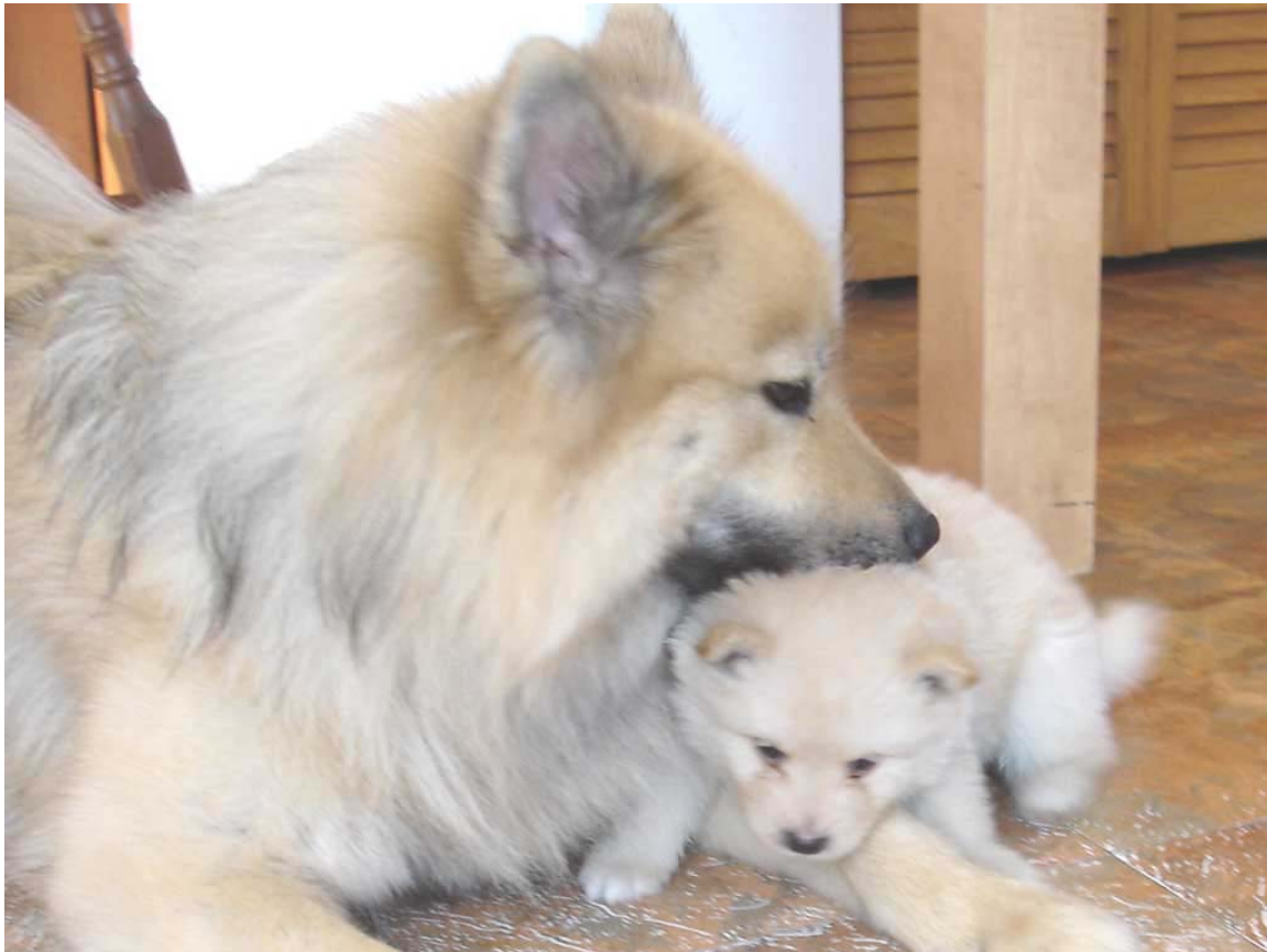
Eurasier : Dancing Bear Ally to Eurasia educate a 4 weeks Finnish Lapphund puppy.