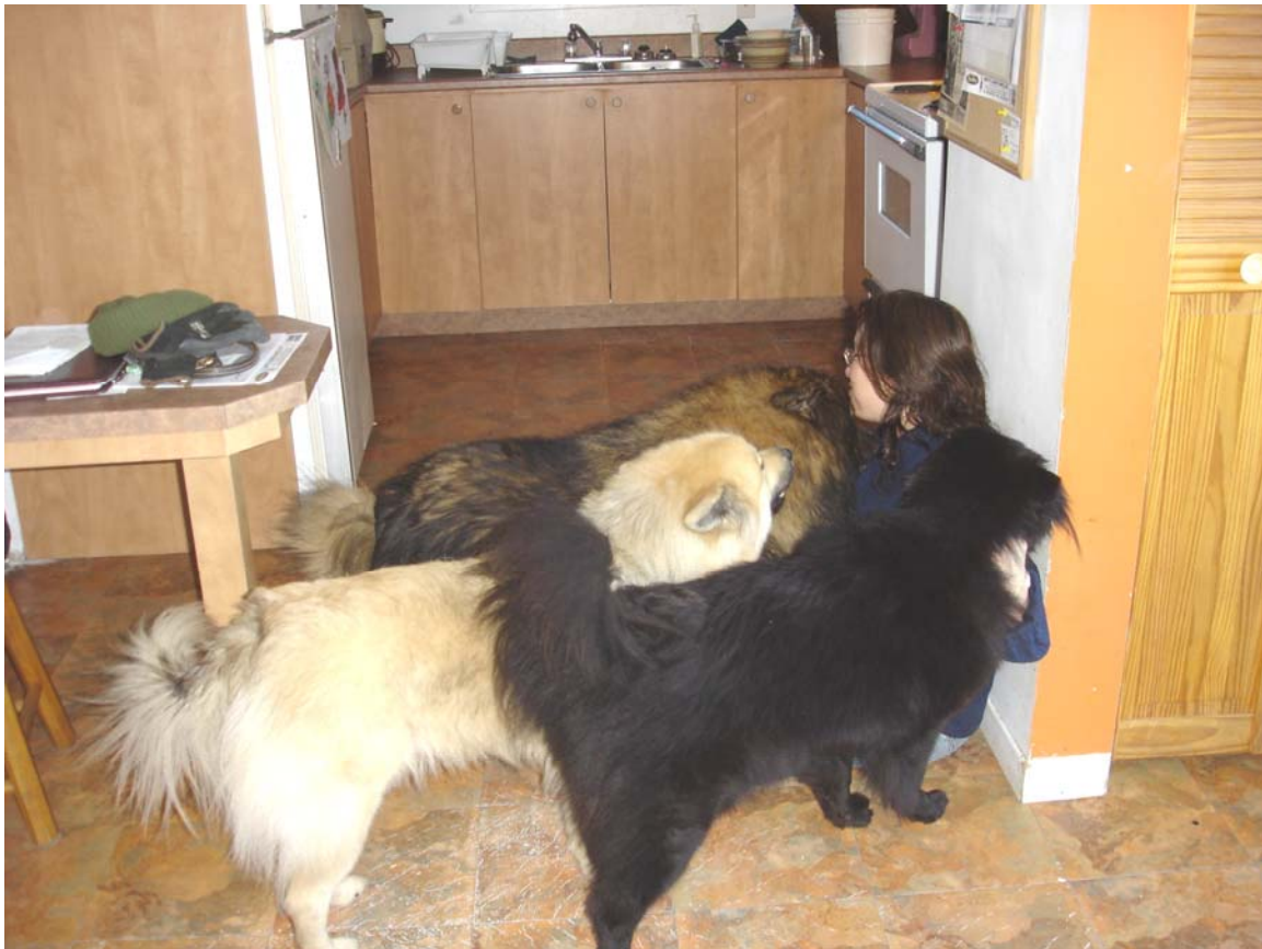
Black Motion Simba of Eurasia, Dancing Bear Ally to Eurasia, Vanille de NiouTchouang and myself.

The crate is the doggie room in our human home. My dogs are not crated all day long... They have access to running free on our property. They received personal affection and attention from me each days of their life. Not all dogs have a crate! I only have ones for dogs who need one.