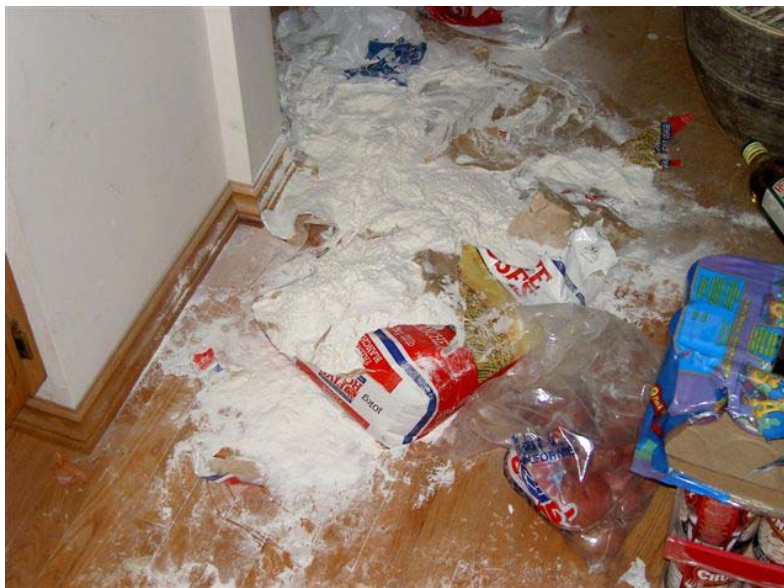
Mess caused by a young dog leaved alone in a kitchen.

The crate is, in most of the time, the place an anxious dog will prefer to be when its owner is not at home. Anxious dogs will pee-poop-chew-bark-howl when alone because these activities help it to reduce its anxiety. Crate is a safe place for it and also for your furniture.