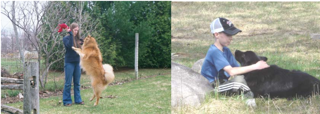
Barnabie Reagan of Eurasia (Gipper) with his young owner.

A dog needs exercise and play time with its owner and family. It needs to be considered as a family member and have daily positive interactions with all family humans.