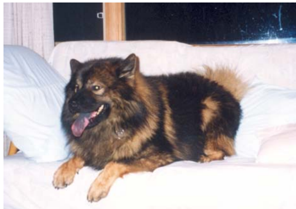
Black Motion Simba of Eurasia

In vet clinics, dogs are putted in crates... and this may increase anxiety for a dog that was never crated. Crate training puppy helps to prepare the dog for this future eventuality.