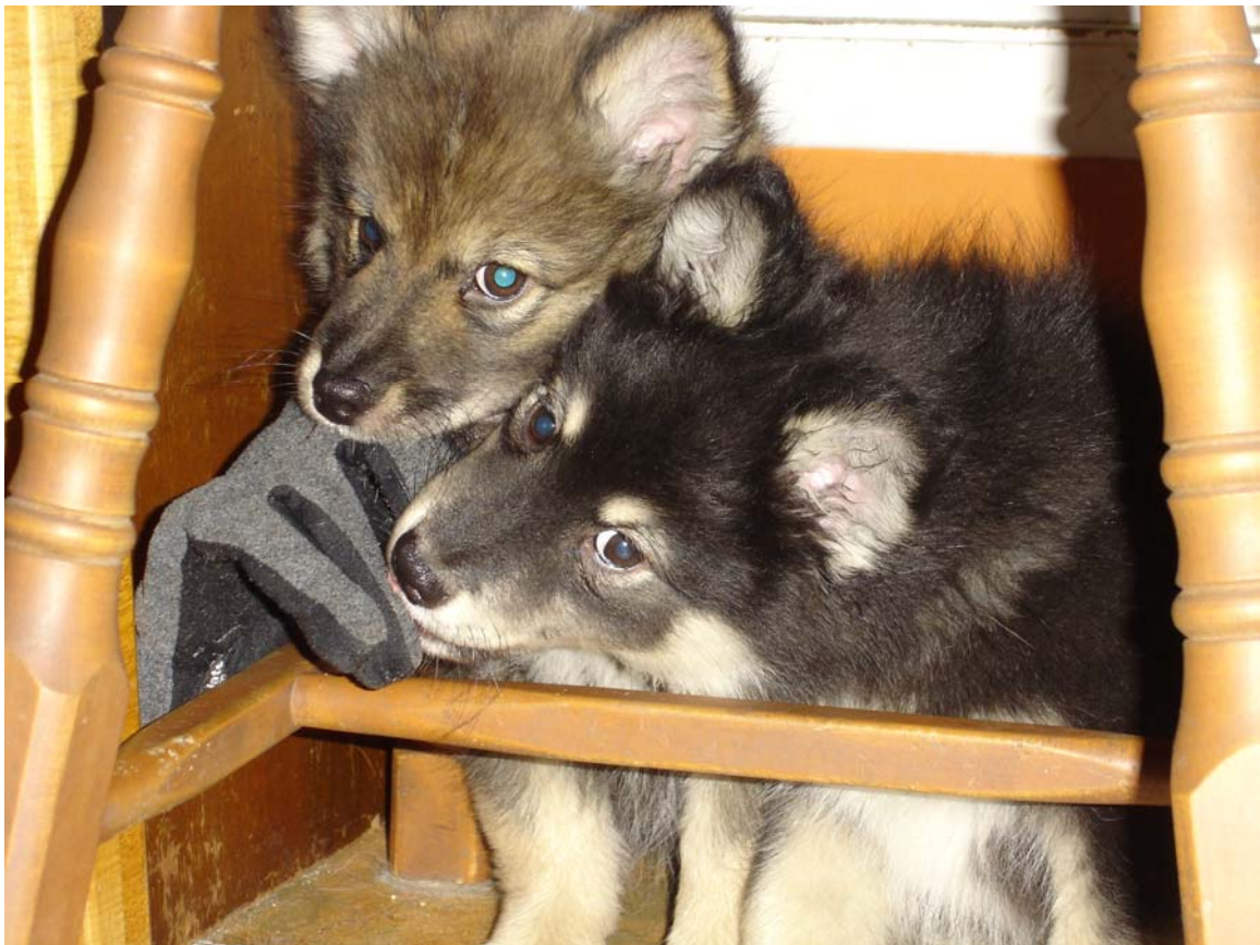
10 week old Finnish Lapphund puppies playing with a glove they stole...

Like human babies, a new puppy needs specific tools and toys. The puppy will put every thing in its mouth to study them and you should have a puppy proof home! Here you will find the puppy check list I prepared specially for you.